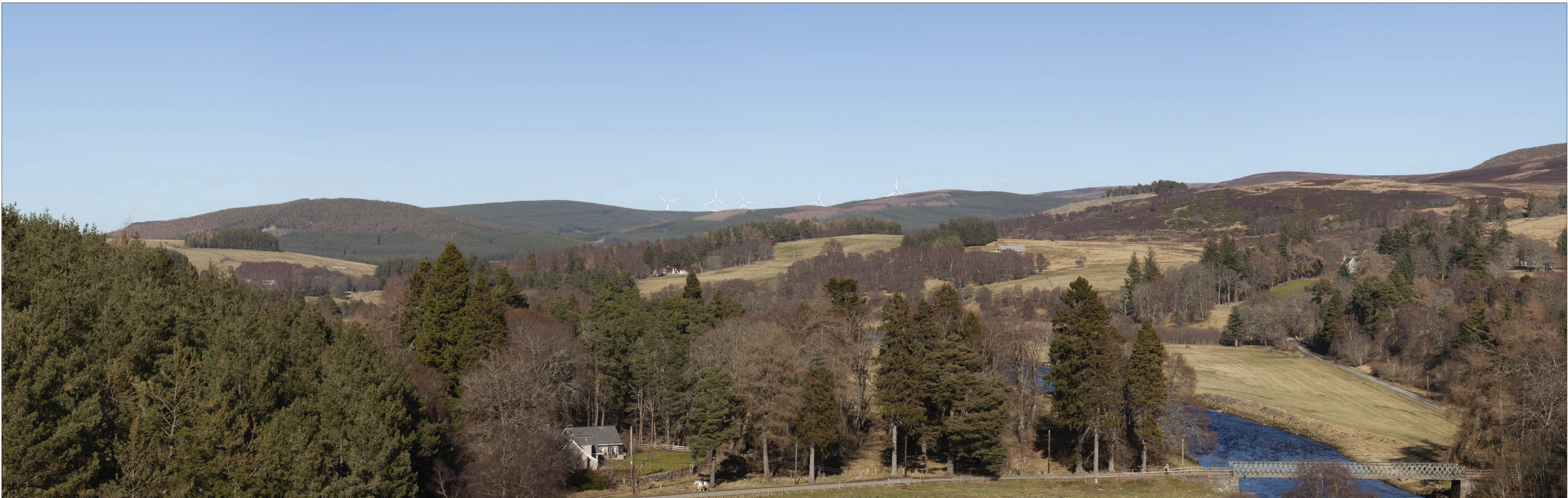
Photomontage showing proposed Tom na Clach Wind Farm Extension