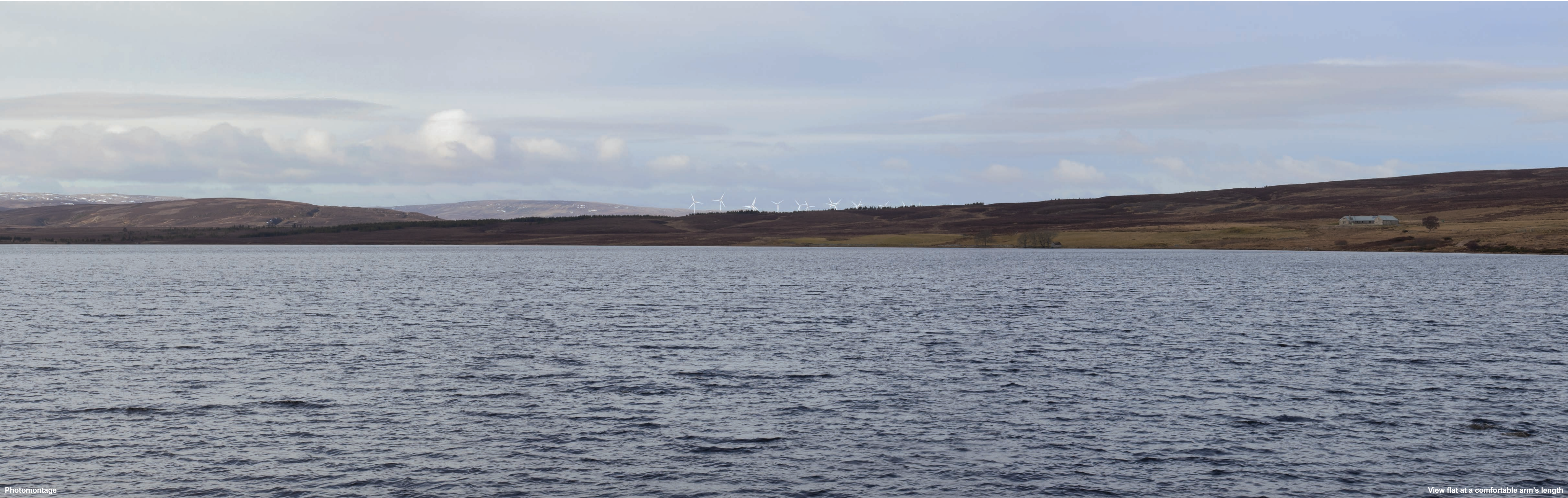
OS reference: 298221 E 837158 N Horizontal field of view: 53.5° (planar projection) Camera: Canon EOS 5D Mark II Figure: 9.37e Viewpoint 14: Shore Road Lochindorb 1 Eye level: 299 m AOD Principal distance 812.5 mm Lens: 50mm (Canon EF 50mm f/1.4) Direction of view: 256.18° Paper size: 841 x 297 mm (half A1) Camera height: 1.5 m AGL Nearest turbine: 10.82 km Correct printed image size: 820 x 260 mm Date and time: 15/03/21, 09:41