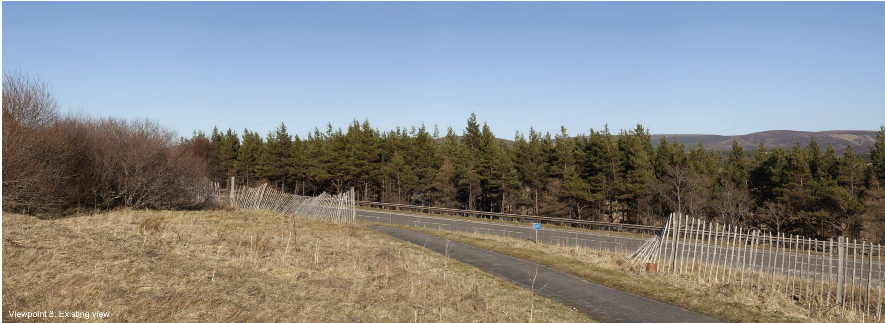
Viewpoint 8: Existing view

Viewpoint 8: Cumulative Wireline. Proposed turbines are shown in red, operational / under construction in blue, consented in purple, application in orange and scoping in green.