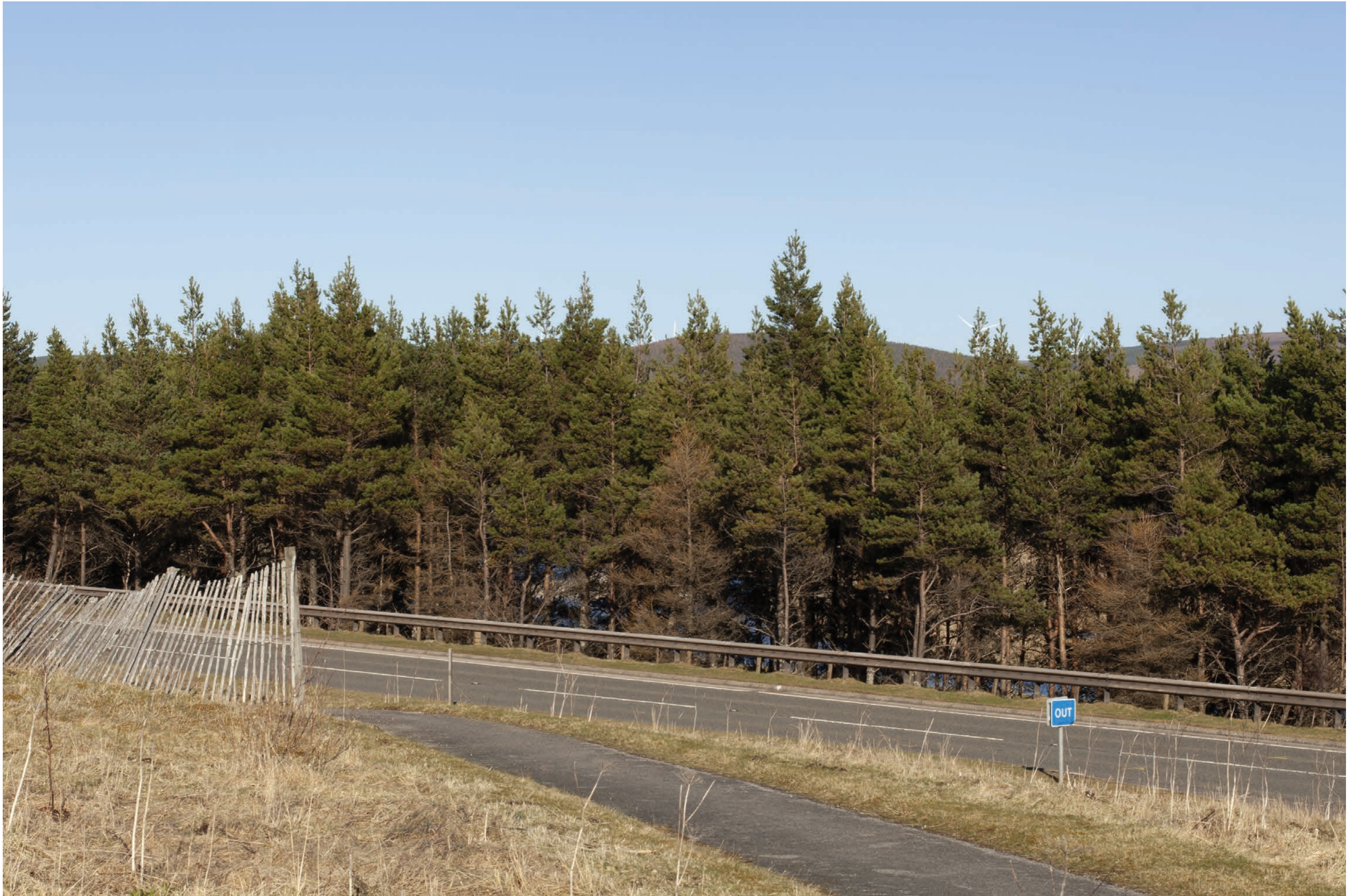
Viewpoint 8: A9(T) north of Tomatin Junction