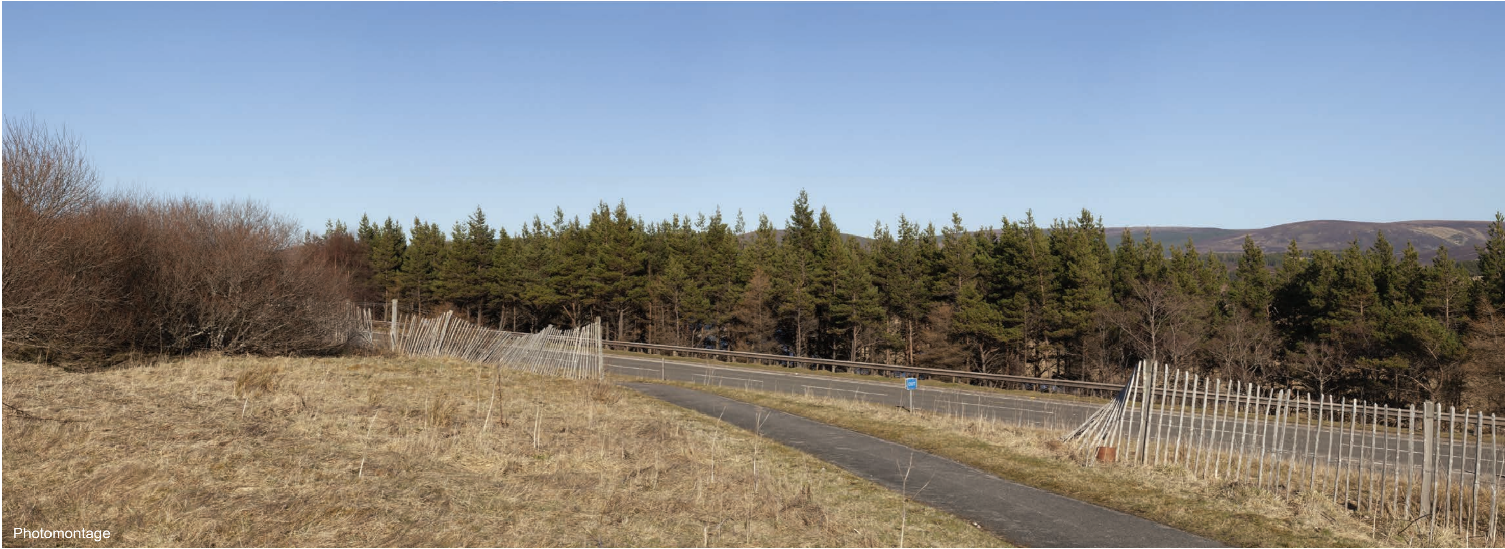
Viewpoint 8: A9(T) north of Tomatin Junction Distance to nearest turbine: 7.5km Camera: EOS 5D Mark II Focal length: 50mm vertical (27°) x 28mm horizontal (65.5°) Camera height: 1.5 m Date/time: 01/04/21, 15:42

The images obtained on this page and the following page are not representative of scale and distance from the actual Viewpoint and show the wind farm development in its wider landscape context only.