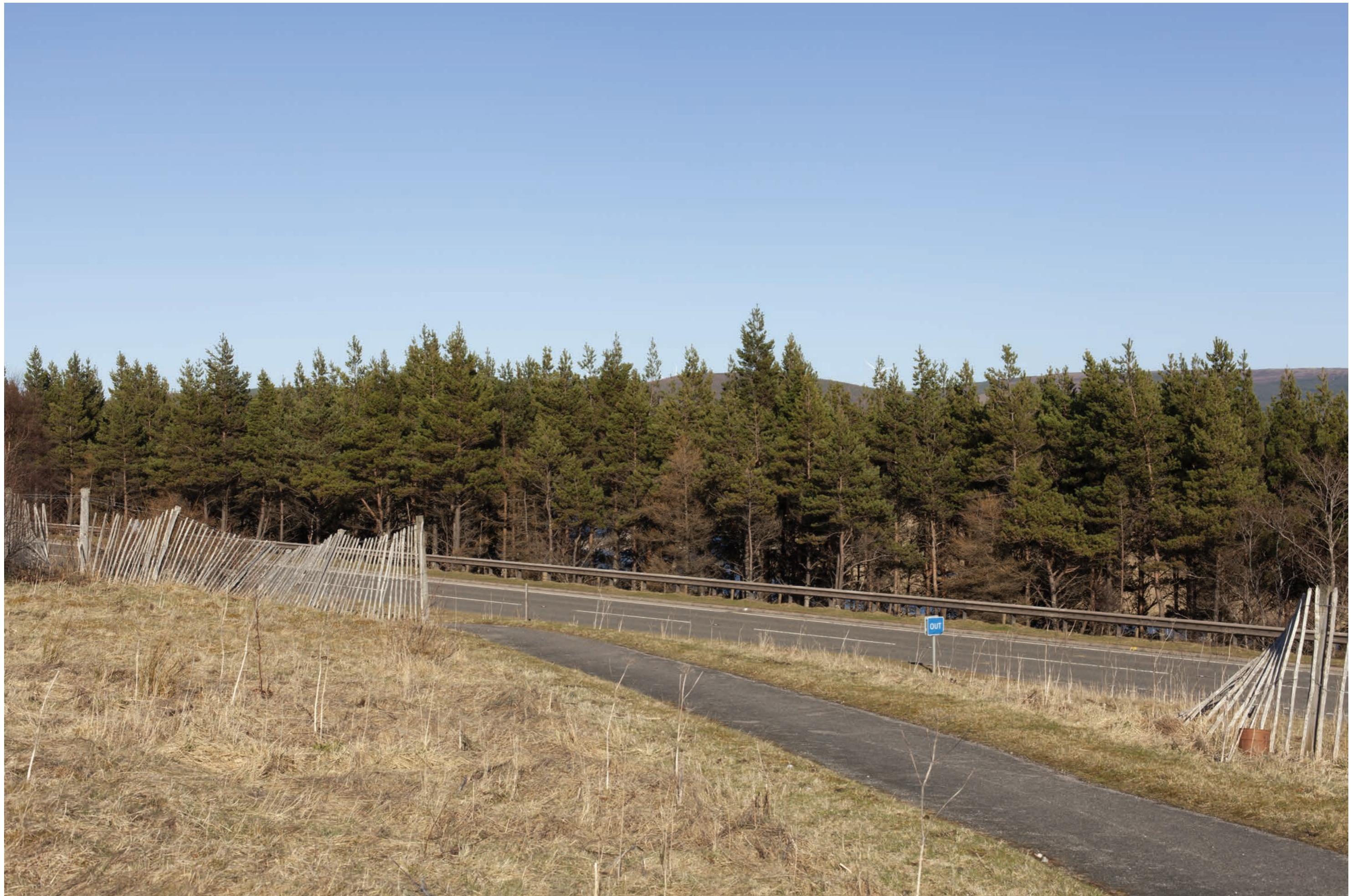
Viewpoint 8: A9(T) north of Tomatin Junction